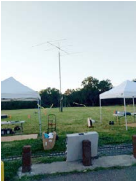
“If you build it they will come.”

•••• , •• , • , •••• , -••• -••• , •- , -•••